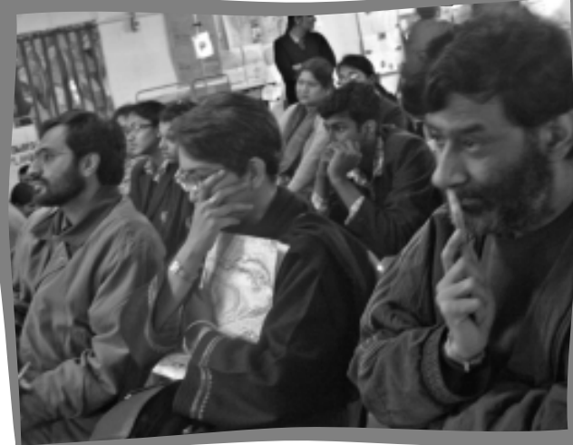
Audience listening to the schools' presentations at the TN Khoshroo Ecology and Environment Award for Schools 2011 (Below)

During the year, we worked towards building value and visibility of youth-led social change in the following ways: