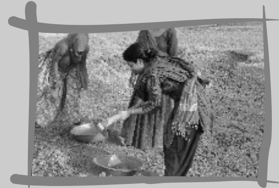
Participant doing shramdaan in Rajasthan

During the year, the SMILE Internship Process, which places young people as