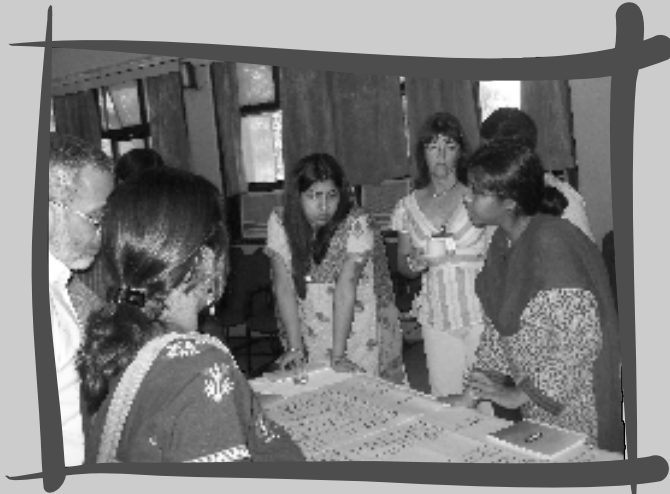
Consultation of the core group to develop impact assessment framework for youth development programs in progress