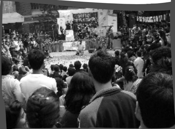
Music for Harmony in progress (Above)