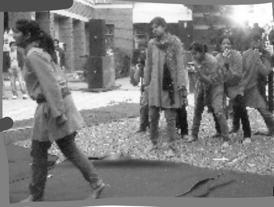
Young people expressing their views on issues they feel about (Below)