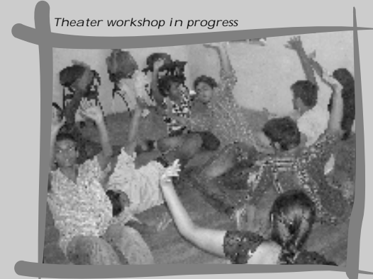
Theater workshop in progress

- Participant placed at NBA for 6 months under the YfD program