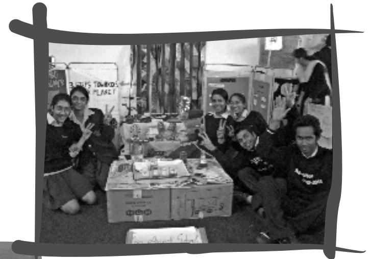
A school team with its presentation at the TN Khoshroo Ecology and Environment Award for Schools 2011 (Above) Young volunteers preparing for the NSS event (Left) NSS Event inauguration in progress (Below)