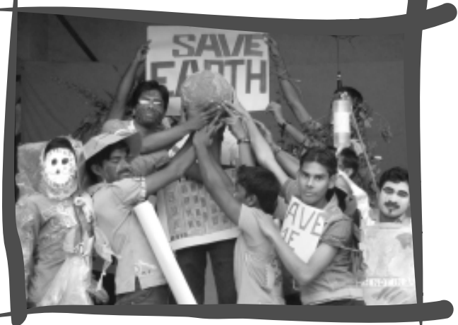
Campaign on Earth Day by youth volunteers at Streaming partner organization Patang, Odisha