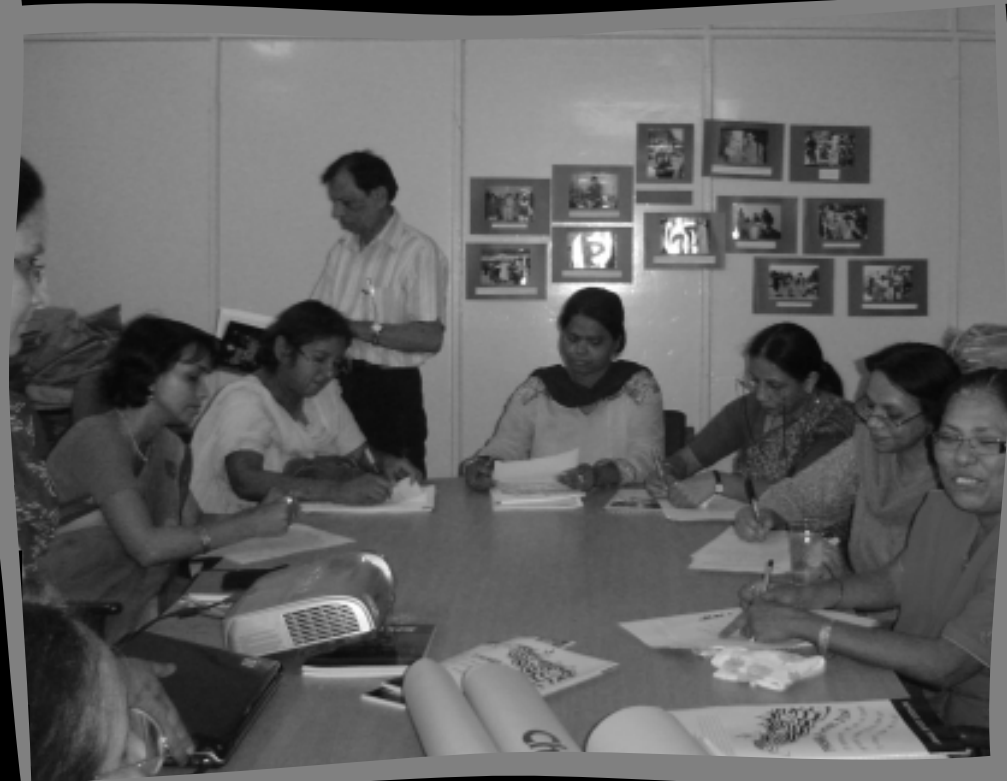
Consultation with NSS-Delhi University Program Officers in progress

Strengthening the institutional framework to promote youth development and citizenship