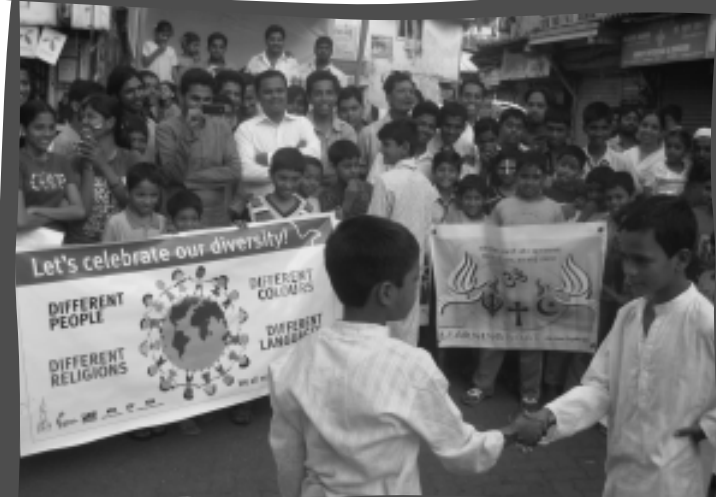
Young campaigners at Streaming partner SAHER 's initiative