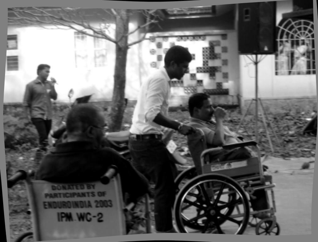
Young volunteers at Students' Initiative for Palliative Care (SIPC)