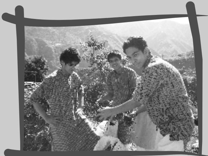
Students at FUN Camp hosted at SBMA, Uttarakhand

- FUN Camp Participant from Sanskriti School, Delhi