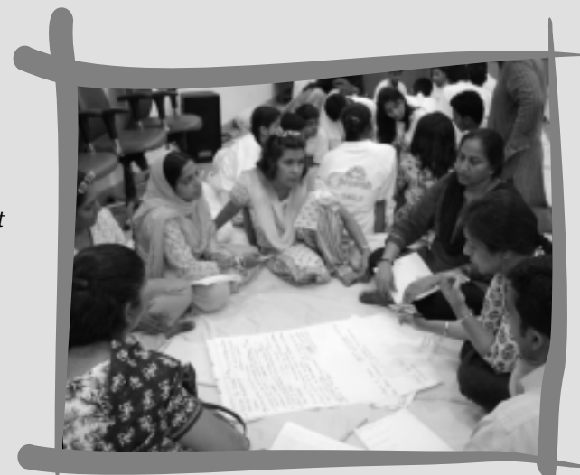
Teachers from various schools in discussion at the consultation

Following the consultation, we started developing a process of appreciative inquiry to identify action and practices that could better promote a supportive learning environment within school systems, especially for life skills and citizenship education. While we designed the process and started discussions with schools, we plan to launch the actual inquiry intensively in the coming year.