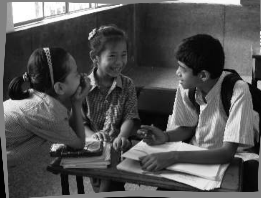
Meeting between the students of the Tibetan School with a student of Sanskriti School during the community visit

Supporting young people to become active citizens