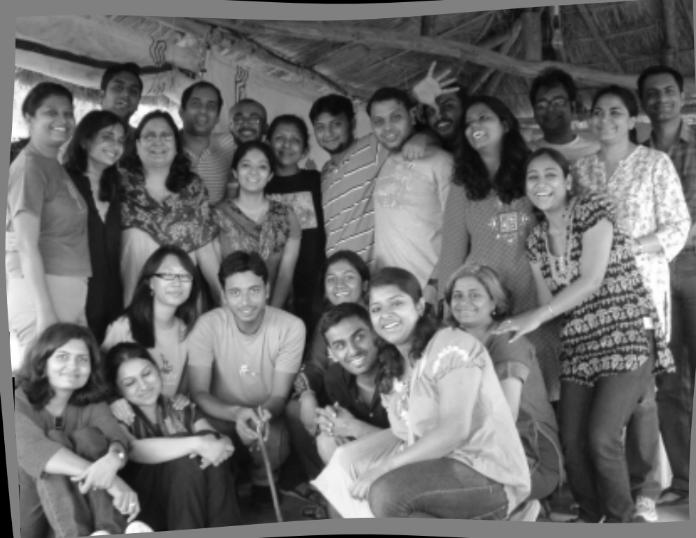
Pravah team at the annual organizational retreat

Strengthening internal organizational development