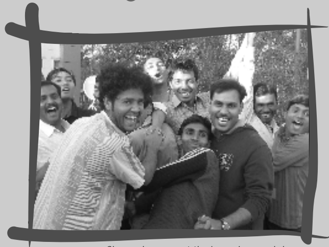
Changeloomers at the Learning workshop

Through Change Looms, in 2010-2011 we felicitated seven youth led teams as they completed their journeys with us and started supporting eleven new youth-led teams from across India that are working for social change for an eighteen month long learning and development journey. At the time of reporting, learning for these teams had been facilitated through a six day long workshop, intensive discussions with mentors and interactions with social sector leaders from across the country.