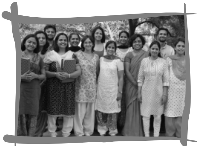
Our facilitators with teachers at Mother's International School

action (for instance, students of Class VI understood the working of local self-governance and village economy through a village visit). Further, through the Senior School Community Service Action program, TRC facilitated the training of community slum children in life skills by senior school students. The core TRC members themselves trained the seniors first to work within the community.