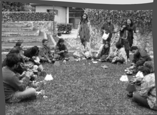
Internal leadership development training in progress

Through ensuring the rigor of a range of organizational processes on learning and development and performance enhancement, in 2010-2011 we were able to continue to enhance the quality of our team and strengthen ourselves organizationally.